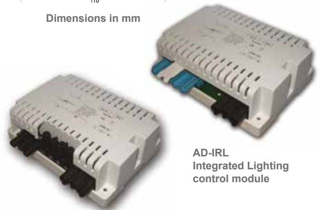
AD-IRL Integrated Lighting control module