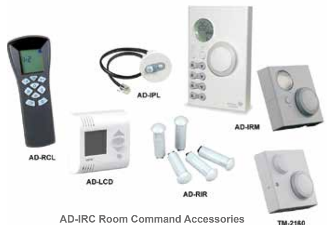
AD-IRC Room Command Accessories